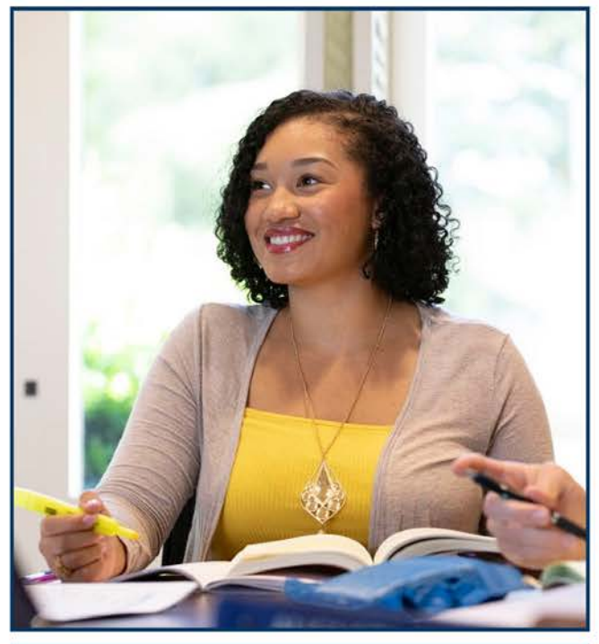
An endowed scholarship can impact students today, tomorrow and forever. Endowments can be created to provide perpetual student scholarships in any of Augusta University's colleges and schools.